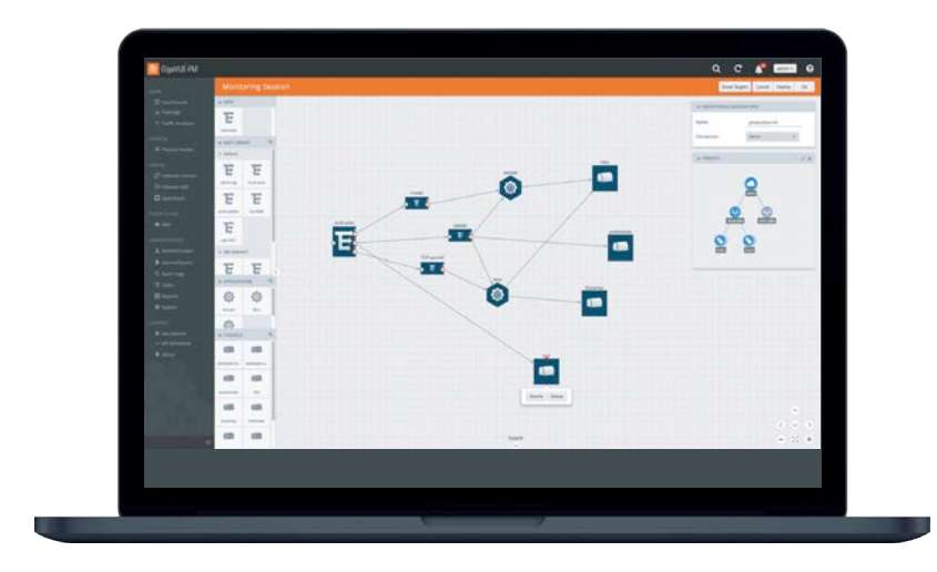
Figure 3: Centralized management, automation, and straightforward process with laaS vendor orchestration suites and Gigamon Fabric Manager.

Gigamon CloudVUE Cloud Suites deliver automated intelligent network and application traffic visibility for dynamic workloads running in multiple clouds including AWS, Azure, GCP and Oracle and enables increased security, operational efficiency, and high-performance processing across these environments. Organizations can optimize costs with up to 100 percent visibility for security without increasing load on compute instances as more security tools are deployed.