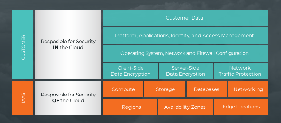
Figure 1: laaS Shared Security Model.

GigaVUE® Cloud Suites resides in the VPCs and VNets and aggregates flows from all compute sites, including from native traffic mirroring nodes. These suites provide advanced highperformance traffic processing such as removing duplicate packets, identifying and filtering applications, generating advanced metadata and optimally distribute and load balance data to the appropriate network monitoring and security tools. This helps ensure effective and comprehensive cloud security.