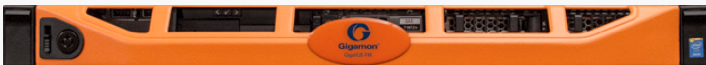
Figure 1. GigaVUE-FM is available both as a physical (shown above) or virtual appliance.

Centralized Orchestration and Management of Gigamon Visibility and Analytics Fabric